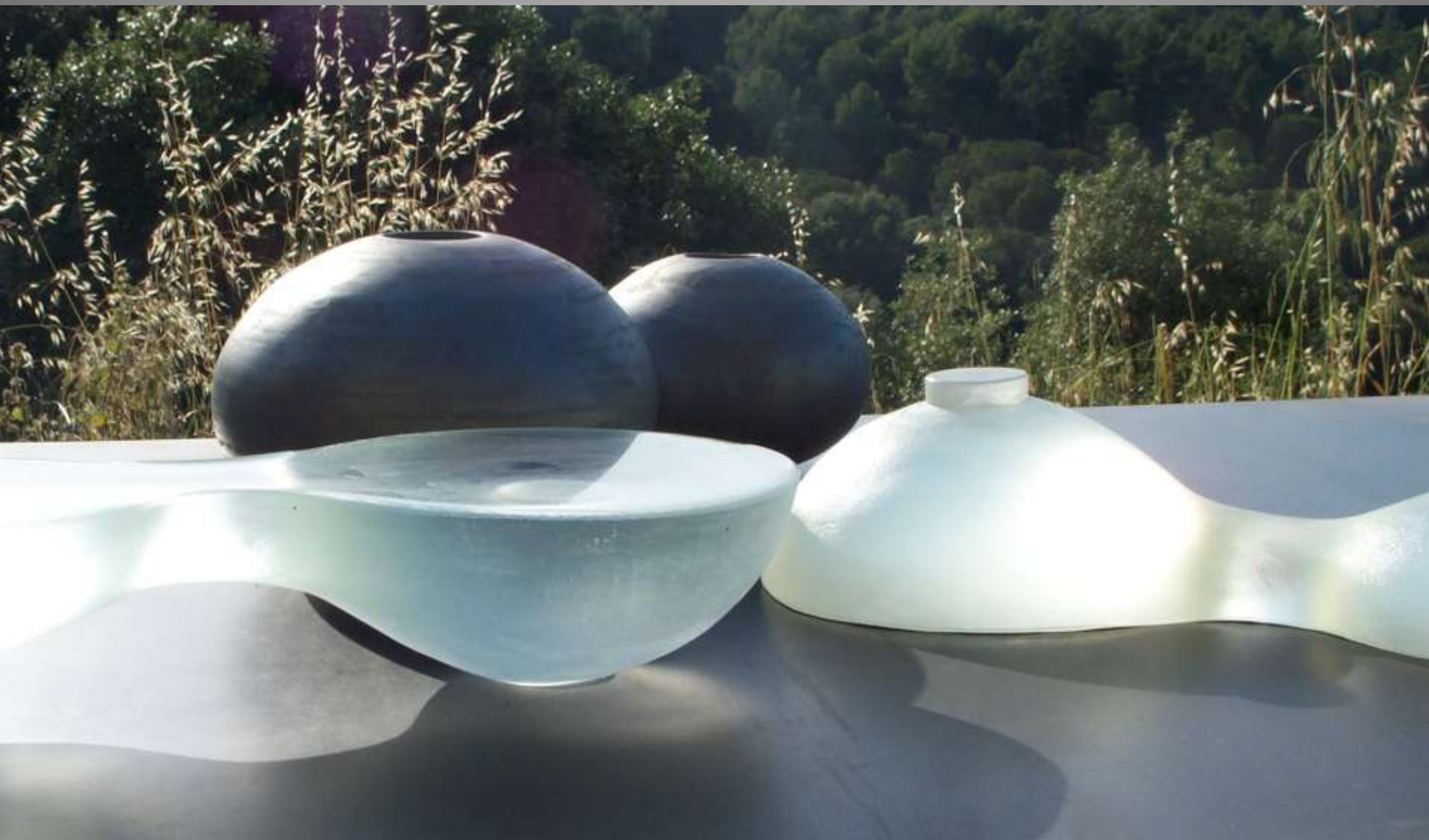
THE SOUND OF FIRE

Glass, UDU African Musical Instrument in Black Ceramics, Iron