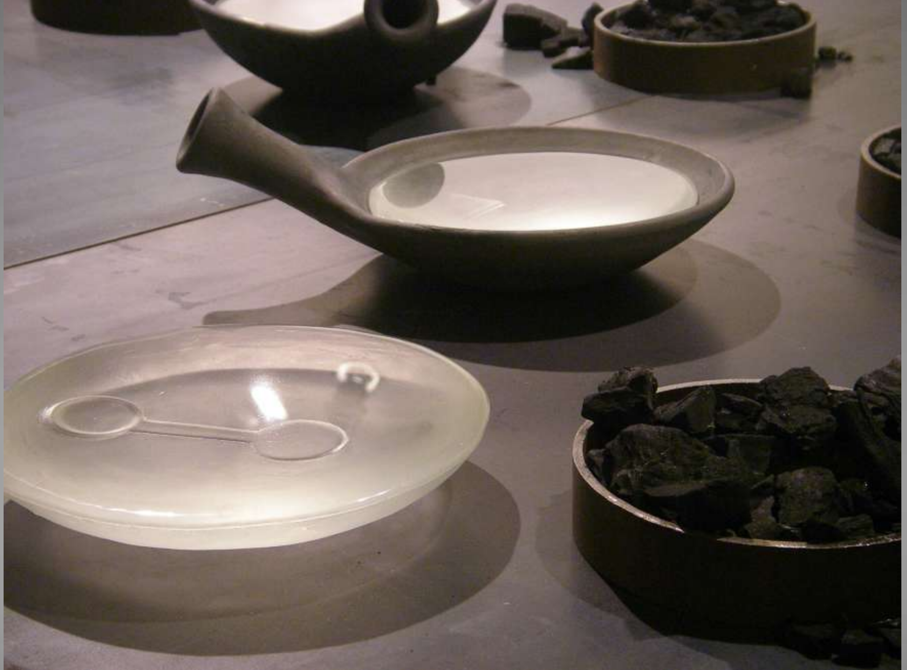
PRINTS Glass, Black Ceramics, Charcoal, Iron 3 m x 1,2 m