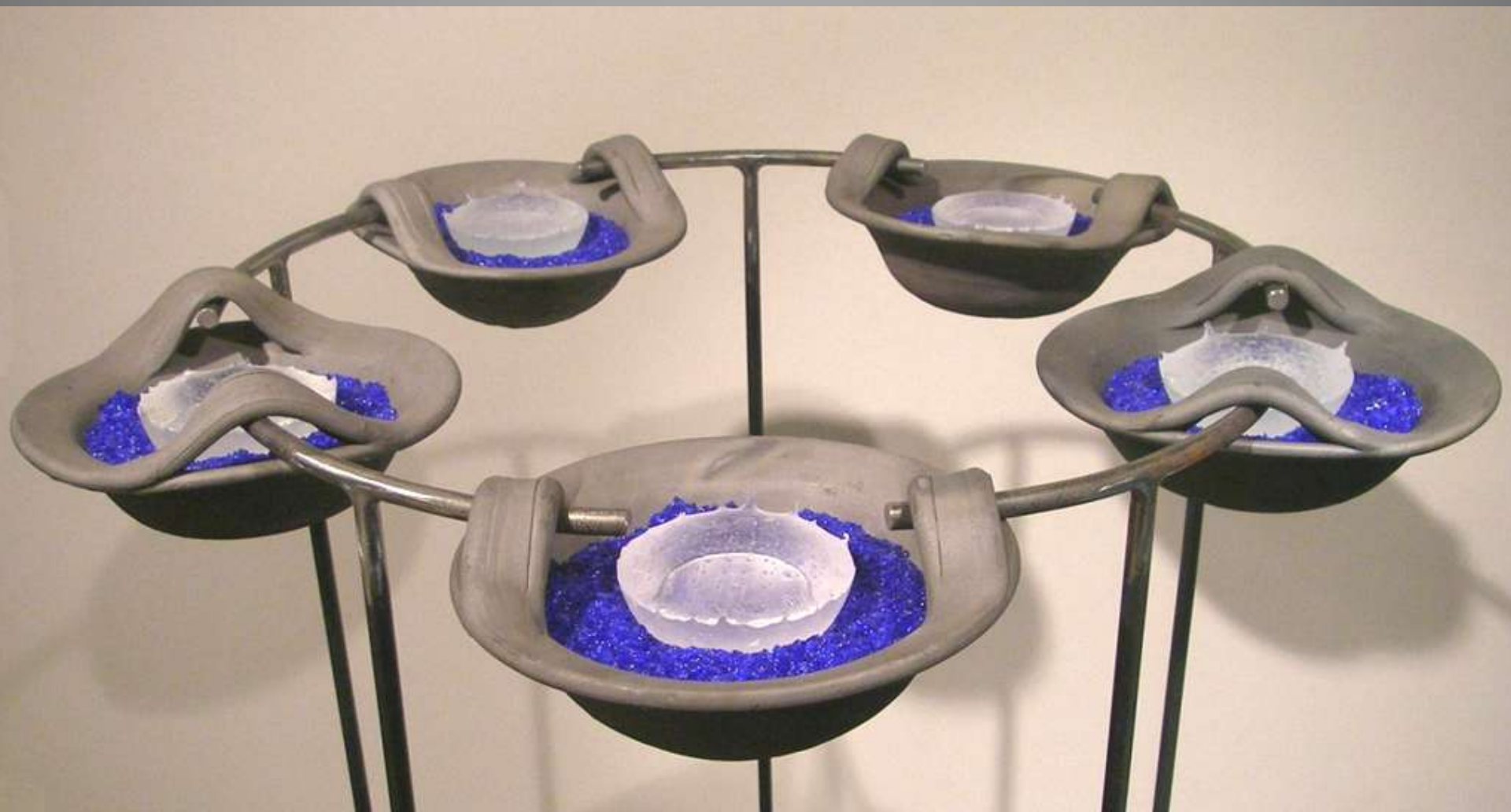
AIR Melted Glass, Granulated Glass, Black Ceramics, Iron 30 x 20 x 10 cm