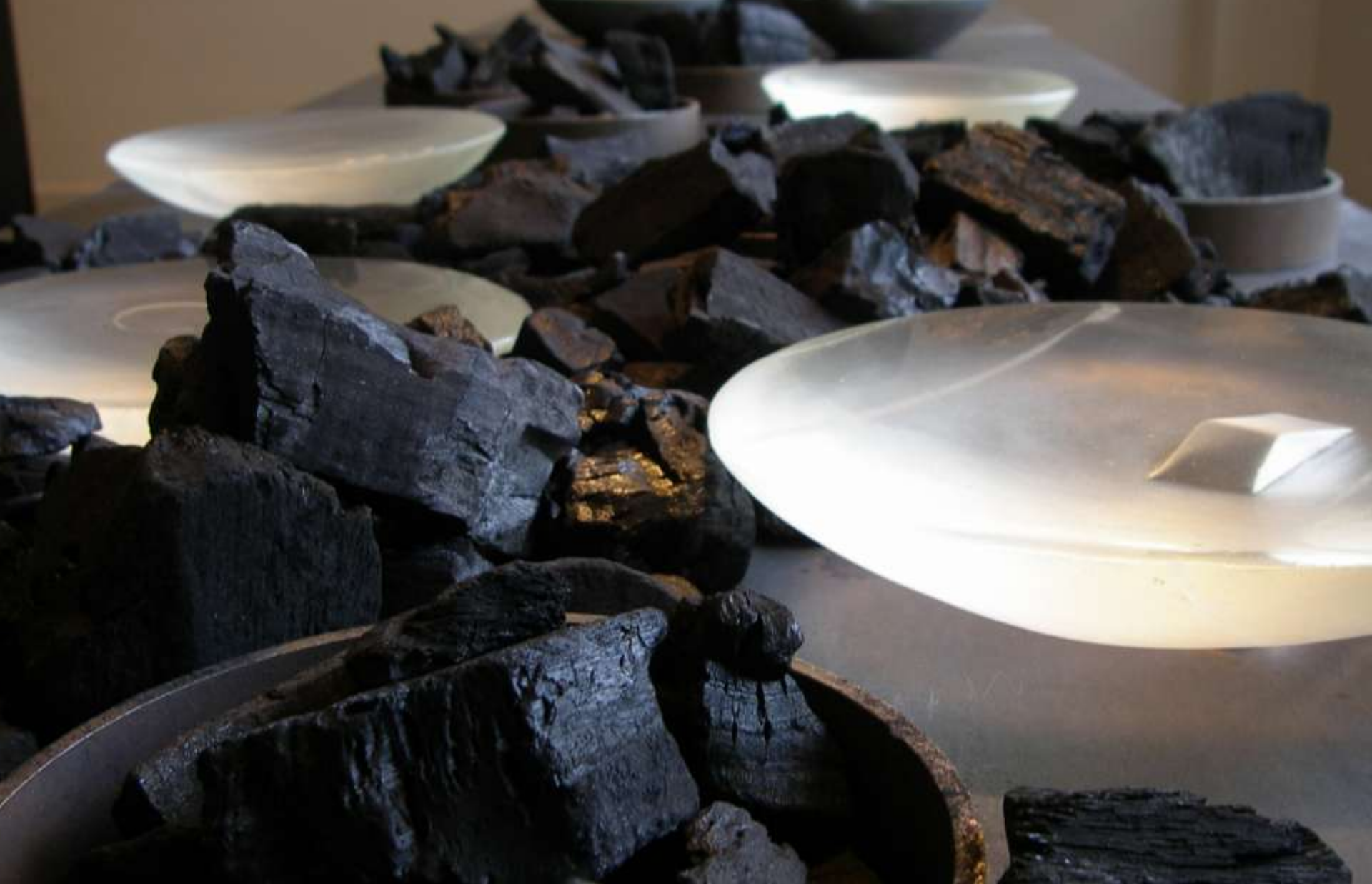
PRINTS Glass, Black Ceramics, Charcoal, Iron 3 m x 1,2 m