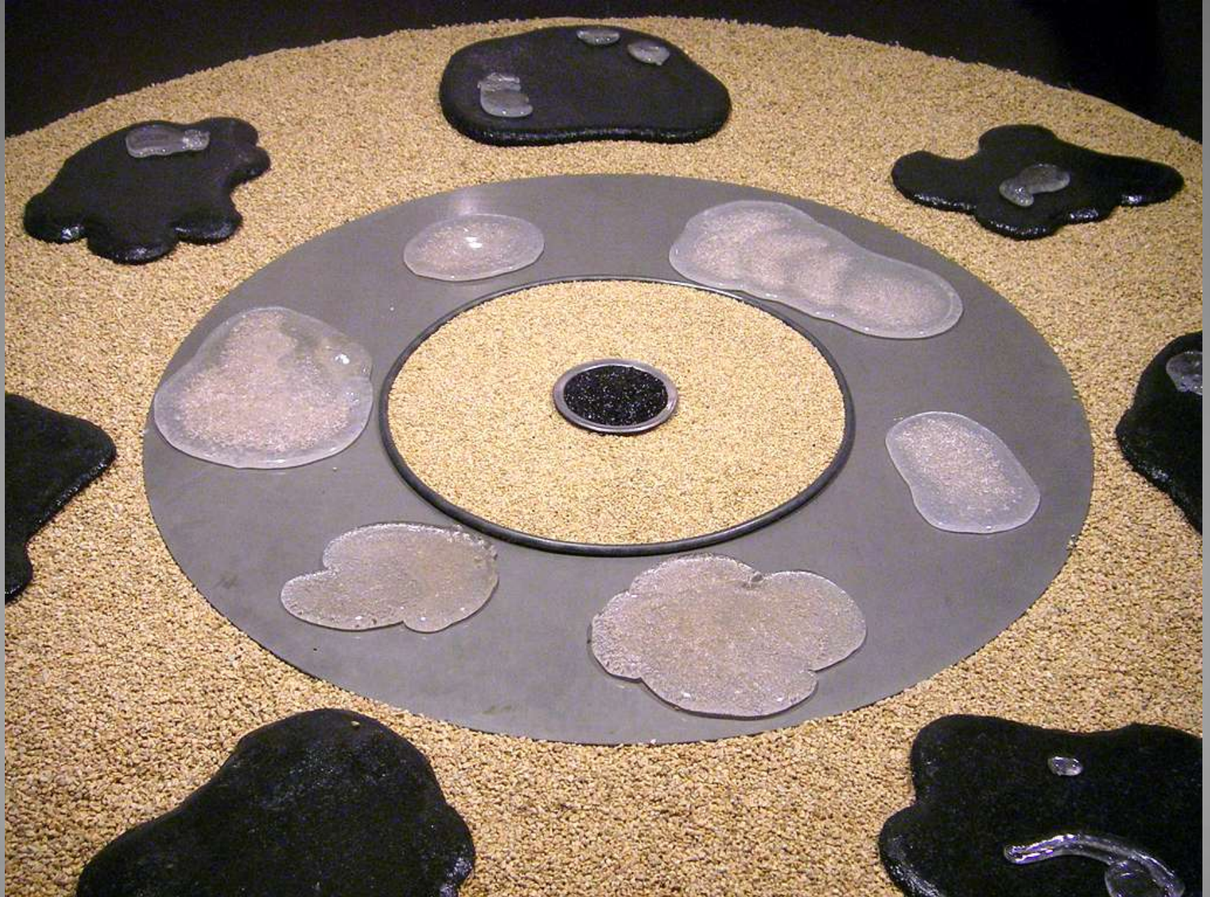
MANDALA - SON OF THE EARTH Glass Drops, Ceramic Drops, Stones, Iron D/ 2 m