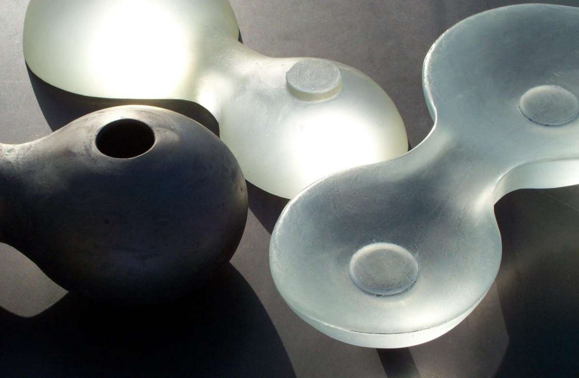
THE SOUND OF FIRE Glass, UDU African Musical Instrument in Black Ceramics, Iron 80 x 80 x13 cm