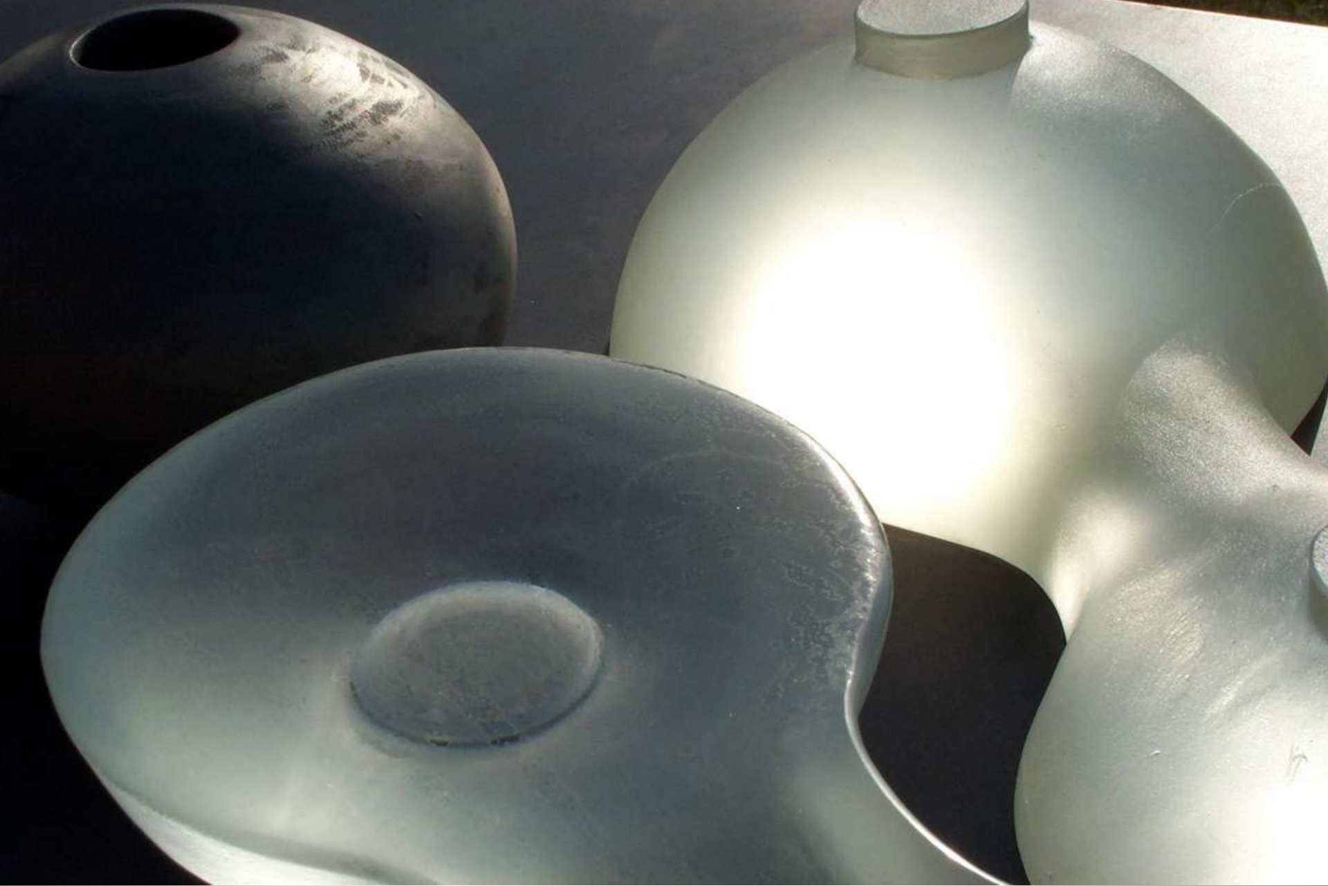
THE SOUND OF FIRE Glass, UDU African Musical Instrument in Black Ceramics, Iron 80 x 80 x13 cm