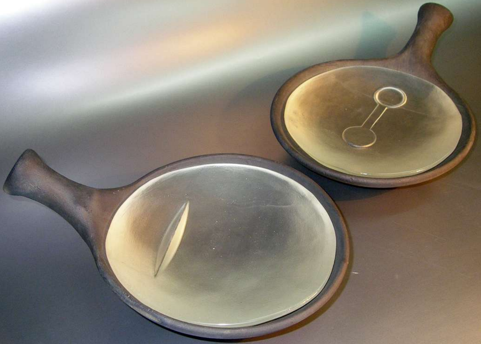
PRINTS Glass, Black Ceramics 25 x 20 x 10 cm