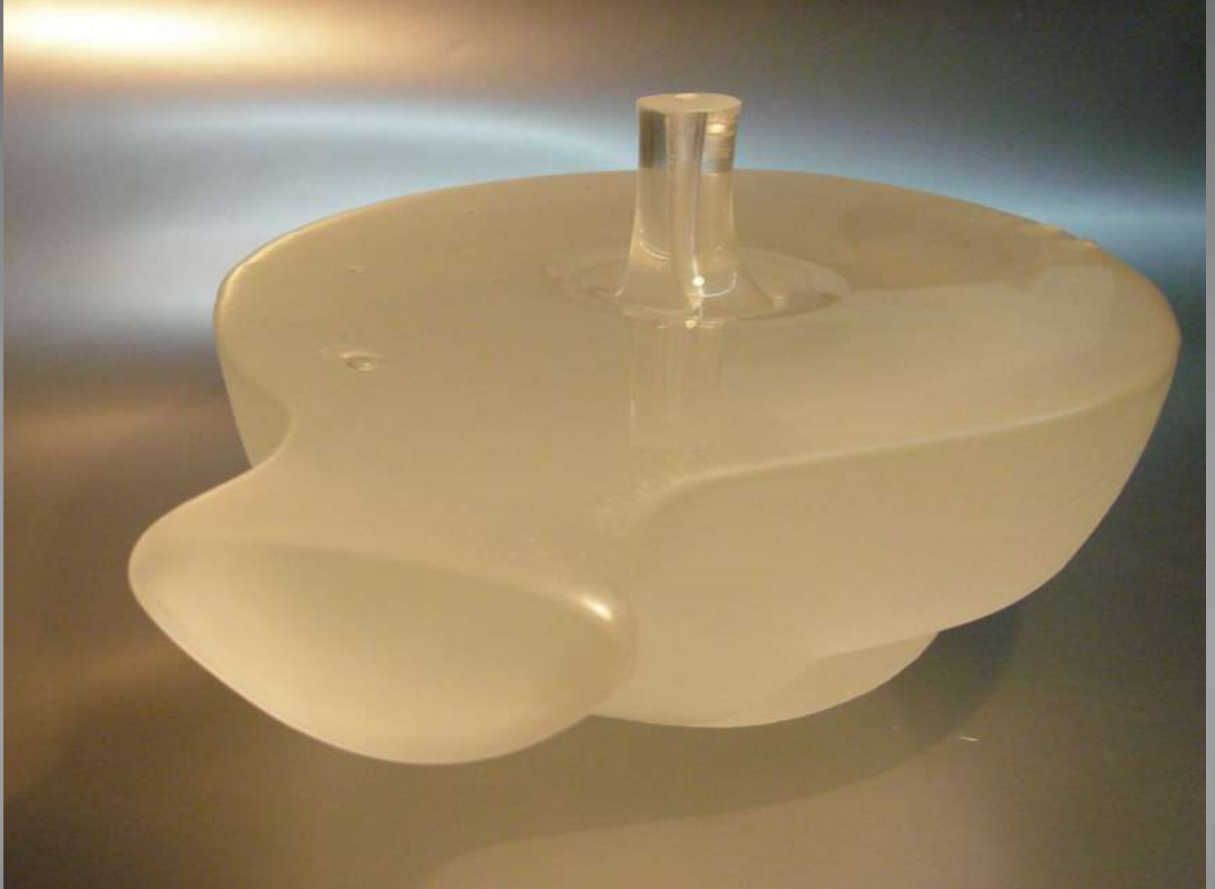
UDU Detail Glass 40 x 25 x 20 cm