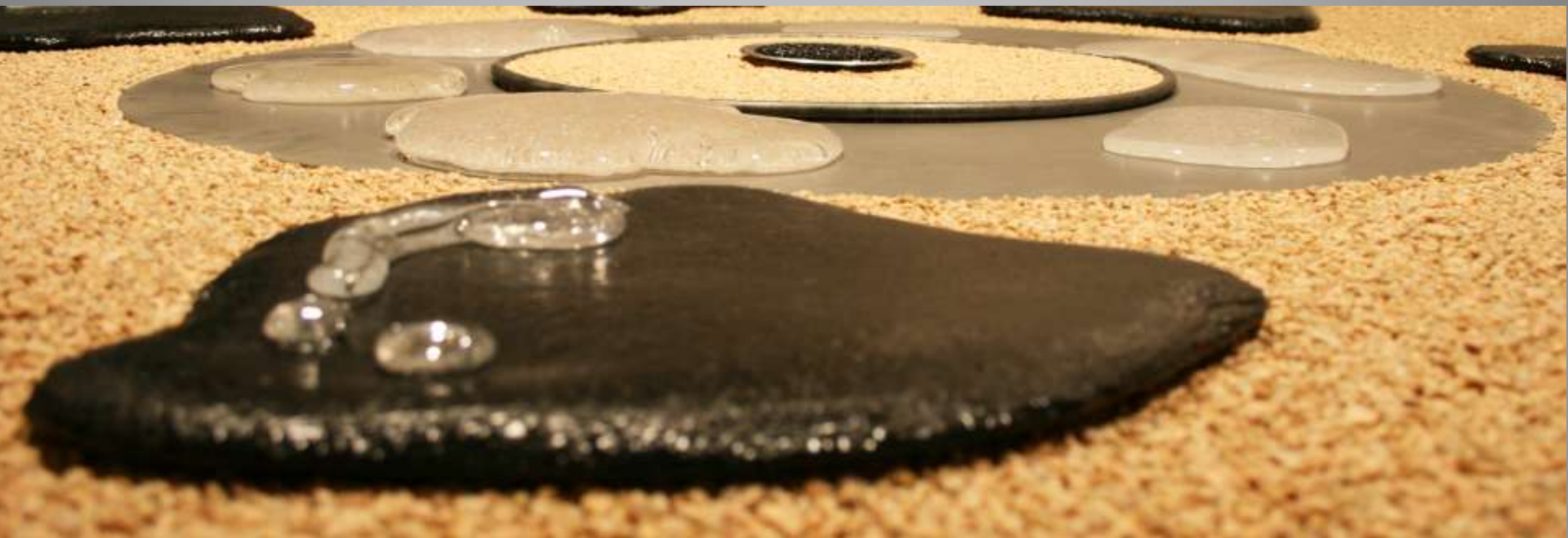
MANDALA - SON OF THE EARTH Glass Drops, Ceramic Drops, Stones, Iron D/ 2 m