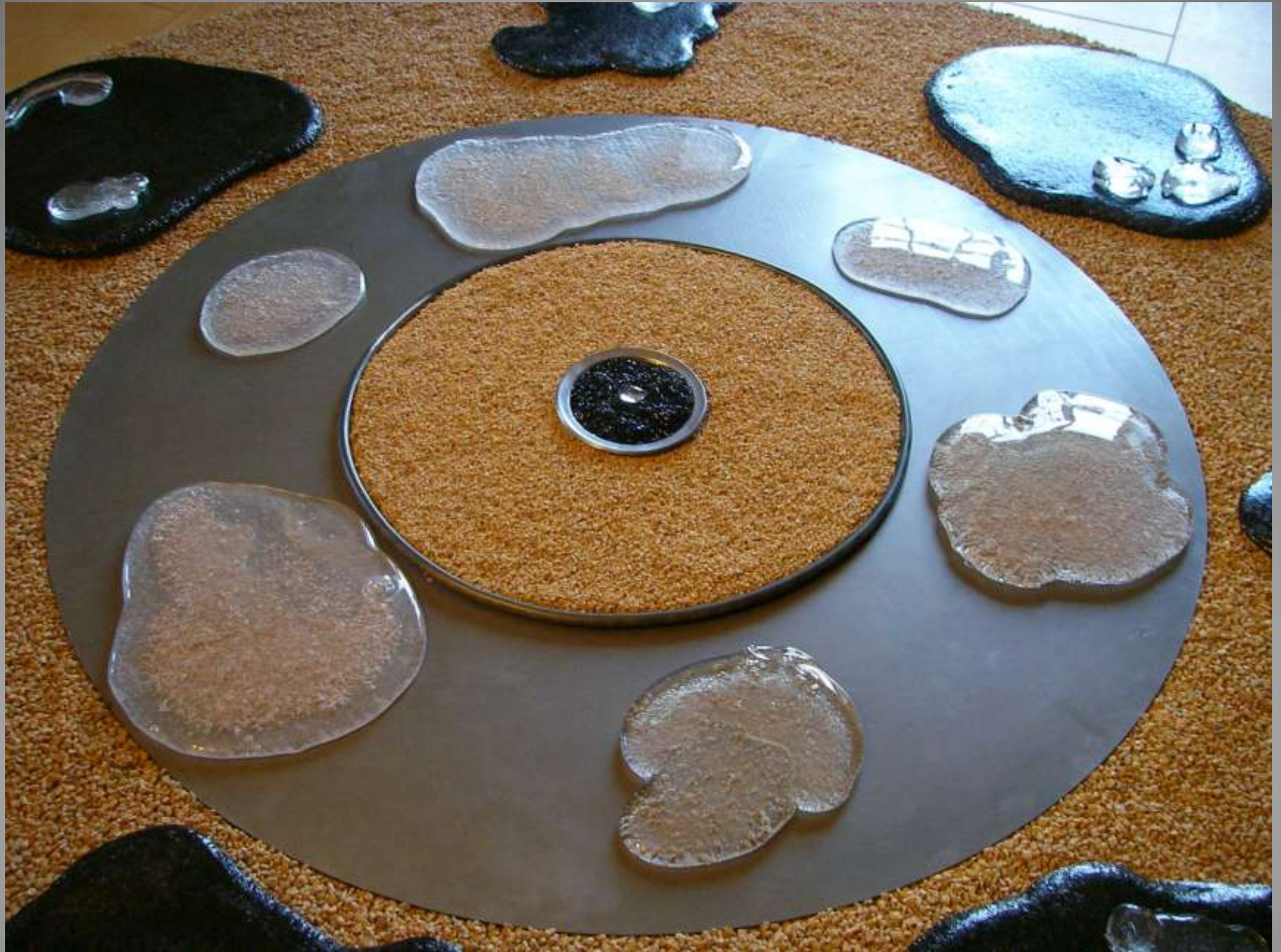
MANDALA - SON OF THE EARTH Glass Drops, Ceramic Drops, Stones, Iron D/ 2 m