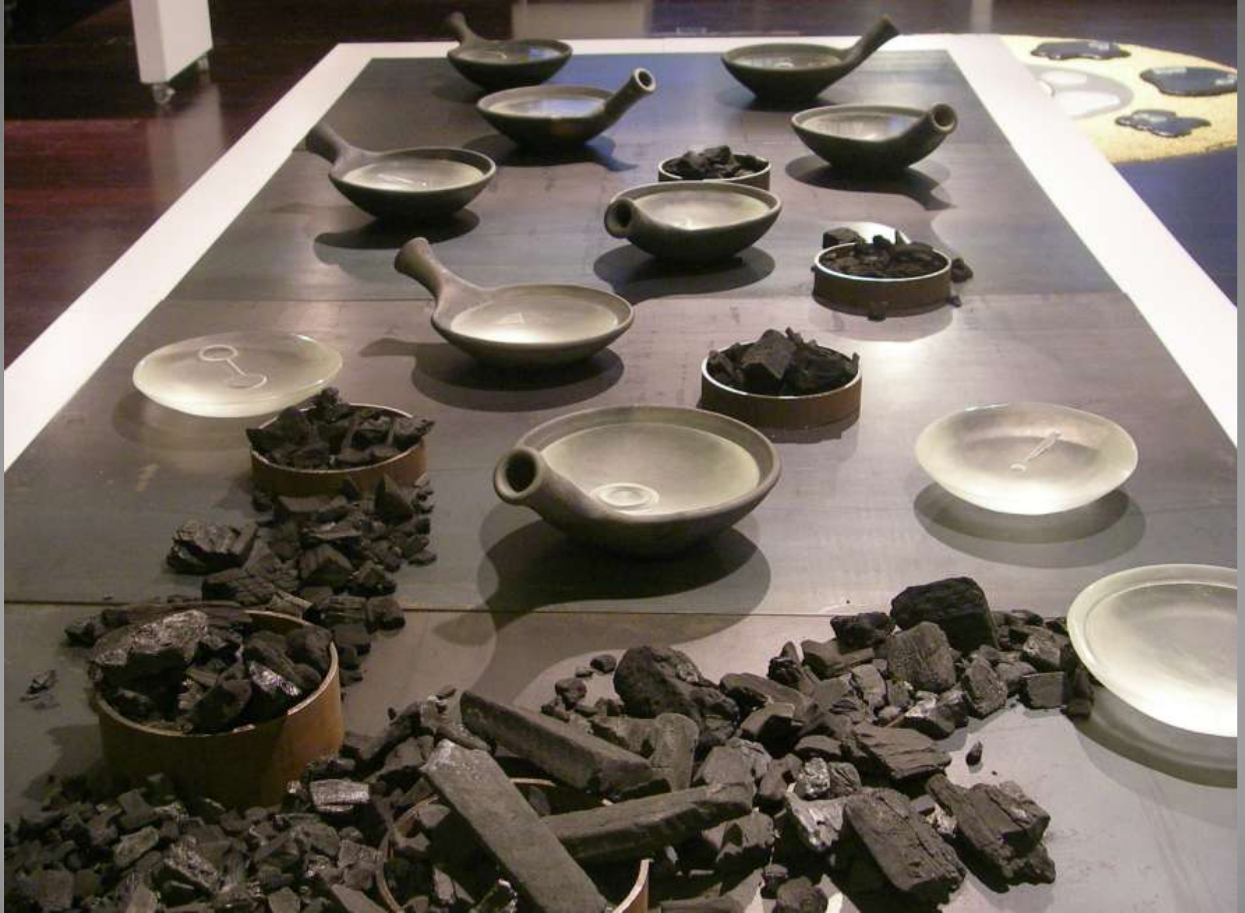
PRINTS Glass, Black Ceramics, Charcoal, Iron 3 m x 1,2 m