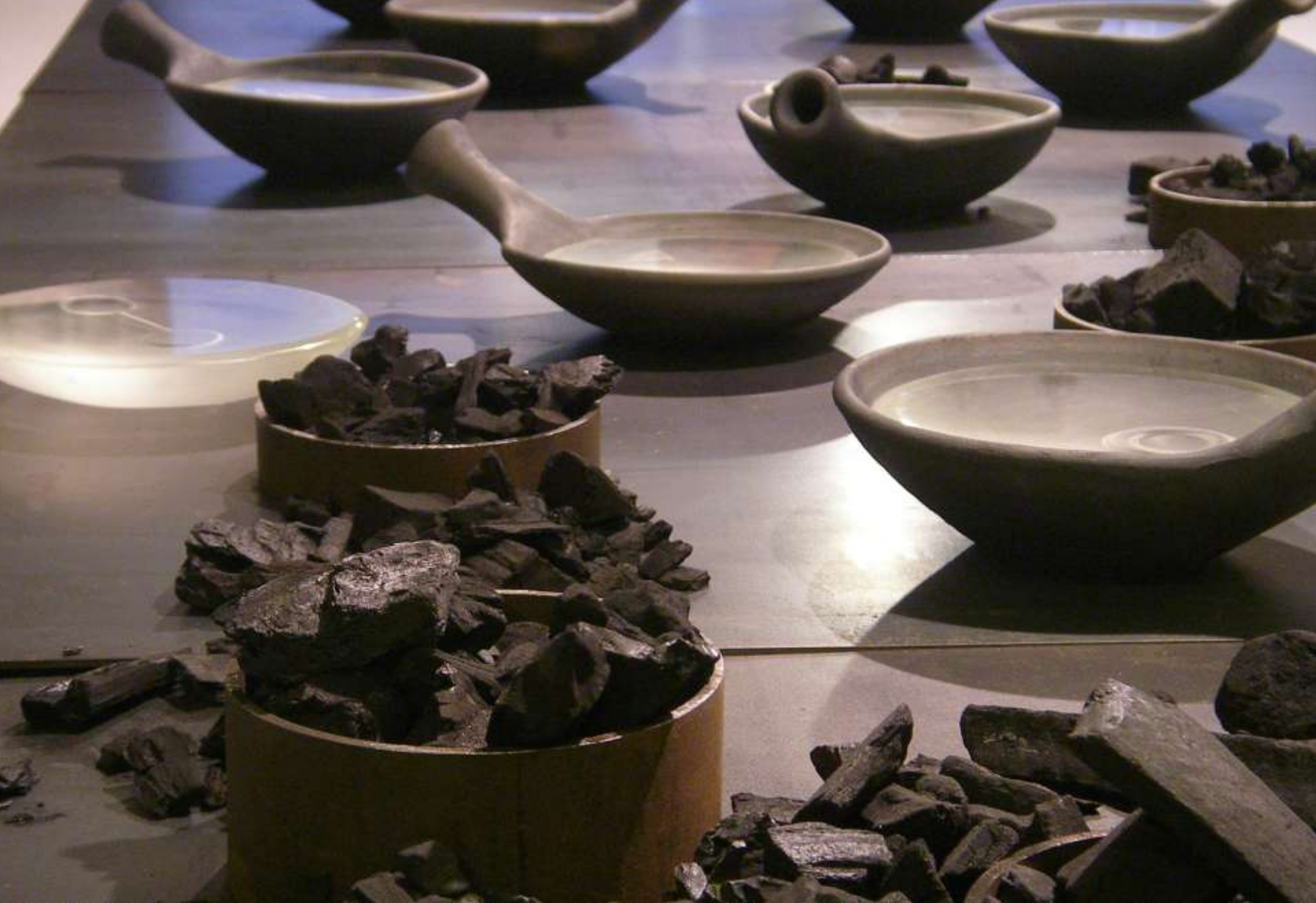
PRINTS Glass, Black Ceramics, Charcoal, Iron 3 m x 1,2 m