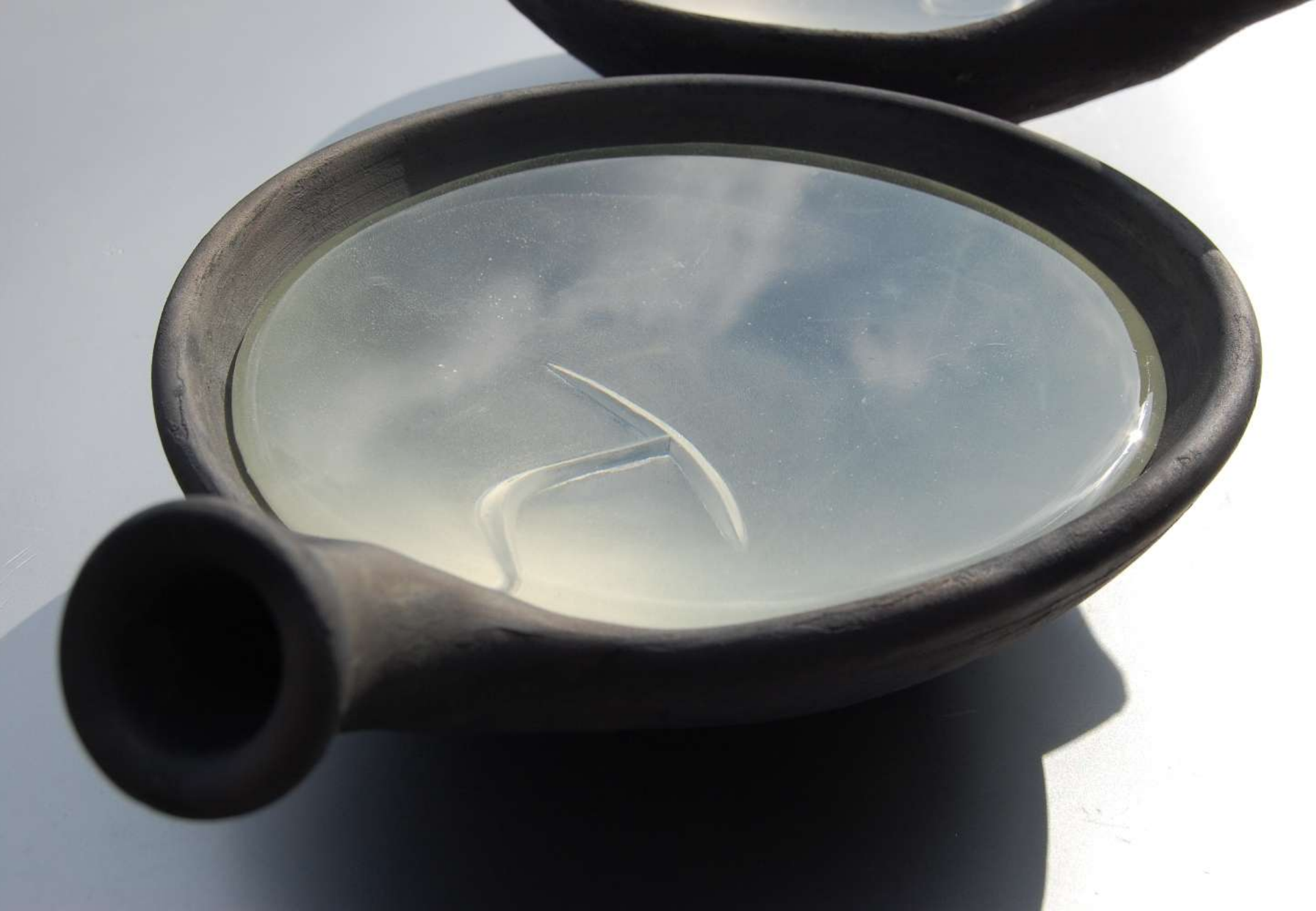
PRINTS Glass, Black Ceramics 25 x 20 x 10 cm